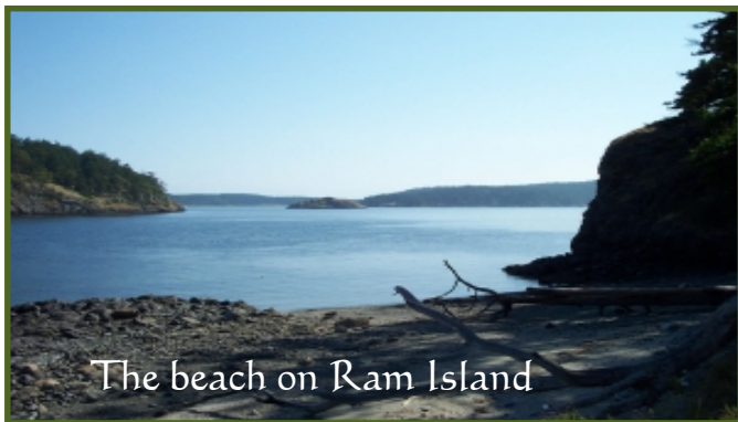
The beach on Ram Island