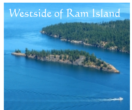
Westside of Ram Island