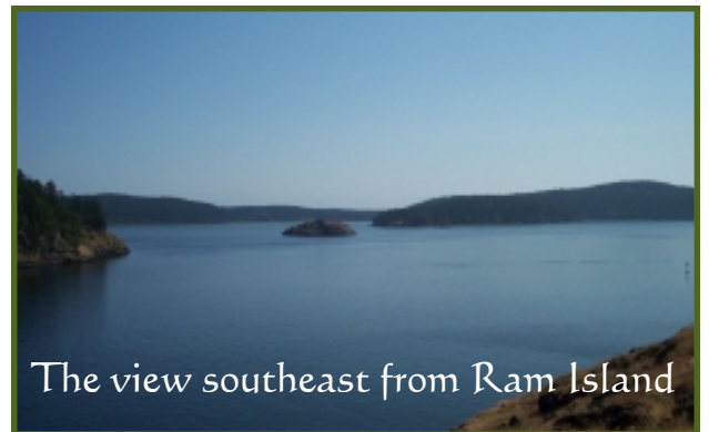
The view southeast from Ram Island