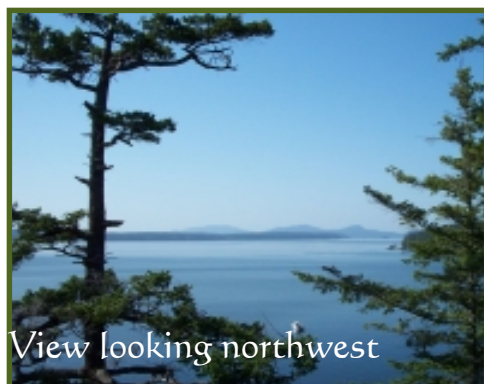
View looking northwest