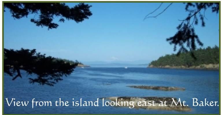
View from the island looking east at Mt. Baker.

One of the few remaining privately owned and undeveloped islands remaining. Ram Island is almost 9 acres and 3800 feet of waterfront. The island has many interesting parts, gravel beach, old forest, grassy plains, and hilltop pinnacle over looking vast stretches of islands and waterways. 360-degree views of Mt. Baker, Olympic Mts and countless islands. Septic design approved, building and dock permits in process. Reverse osmosis desalination system best option for potable water.