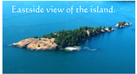
Eastside view of the island.